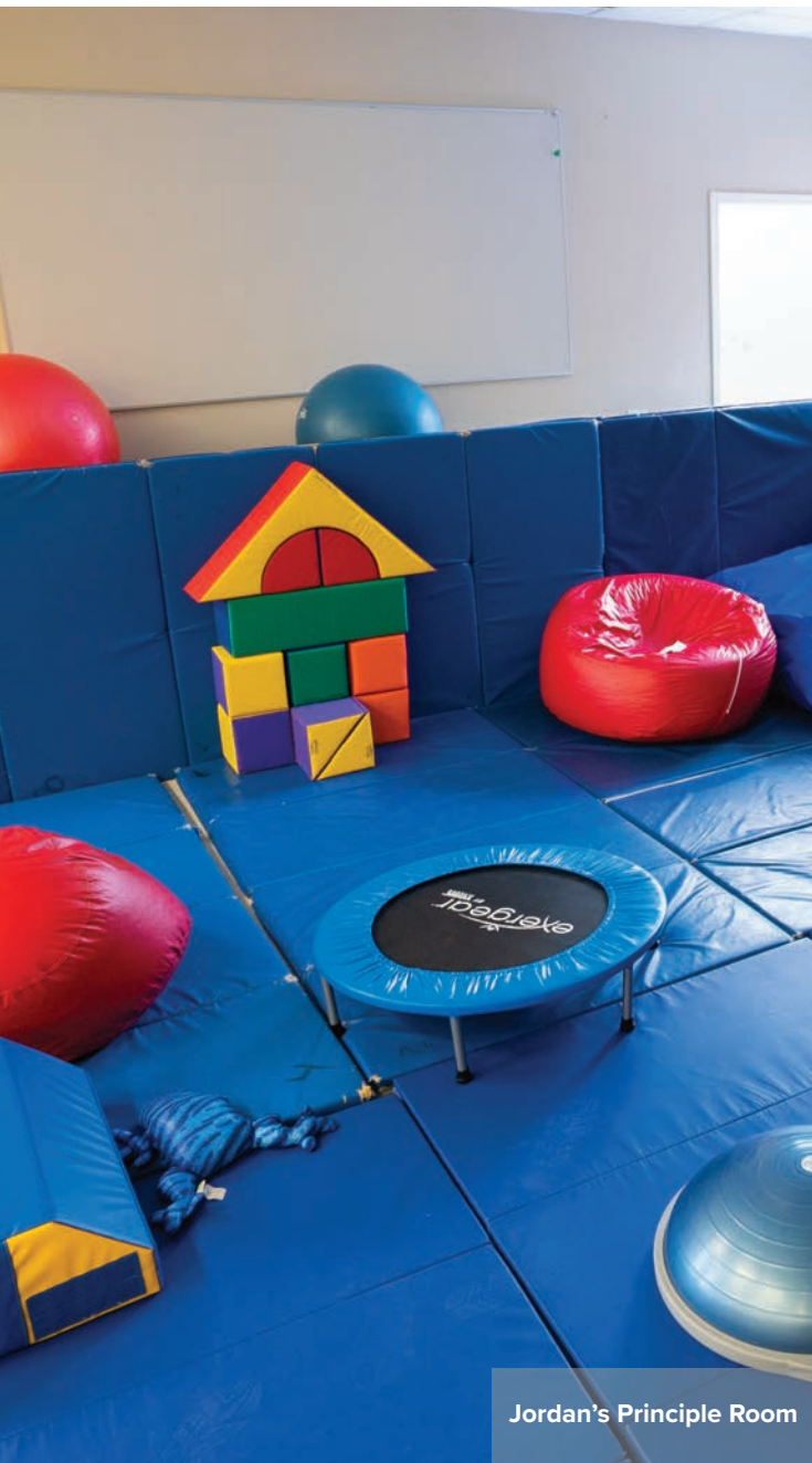
Jordan's Principle Room

Ginew School has a variety of sports teams that often compete with other schools. Some of these sports include baseball, basketball, volleyball, and track and field. Students also participate in science fairs with students from other schools.